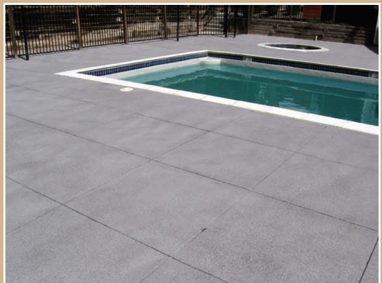
Table Mountain Creative Concrete